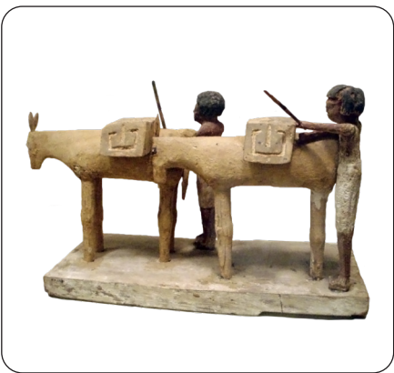
Ancient Egyptian figurines

The making of statues, statuettes and figurines is an ancient craft. It was an important part of the culture of past civilisations, including ancient Sumer, ancient Egypt and the Indus Valley. The sculptures made by these civilisations include important people, such as monarchs and religious deities. They also tell us about the everyday lives of the people who were part of these ancient civilisations and the things that were important to them.