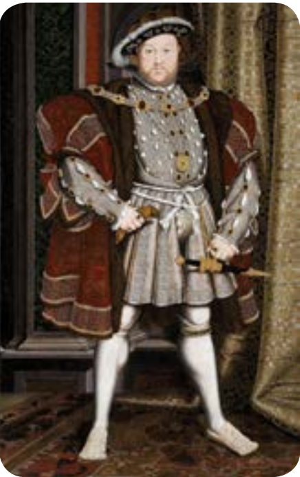
Henry VIII by Hans Holbein the Younger, 1537–47