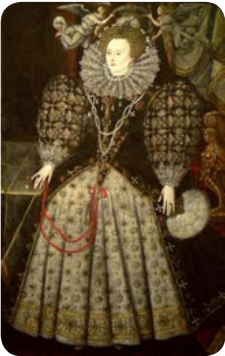
Portrait of Elizabeth I of England attributed to Nicholas Hilliard, 1590